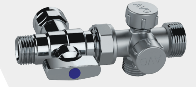
FITS WITH BVT-15